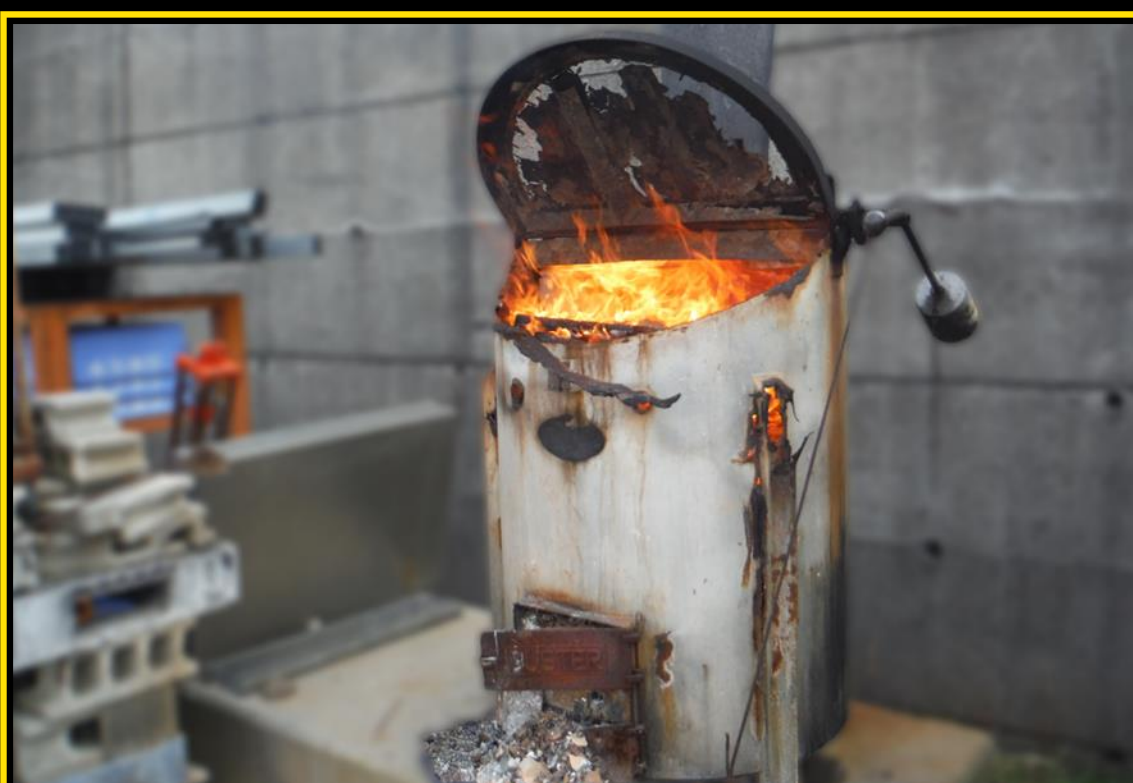
Incineration in non-compliant incinerators