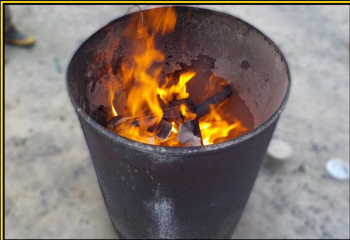
Incineration in drum cans