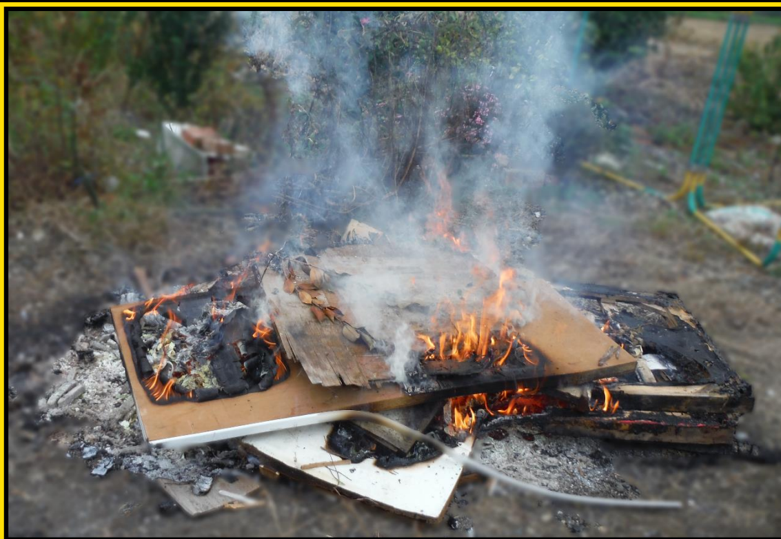
Incineration on the ground or in holes dug into the ground

(*In addition to the above, corporations will be subject to a fine of up to 300 million yen)