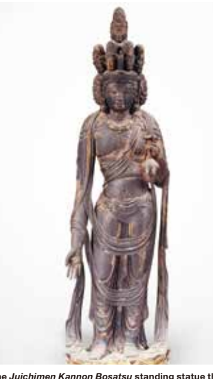
national treasure at KOGEN-JI Temple Heian period (794-1185).