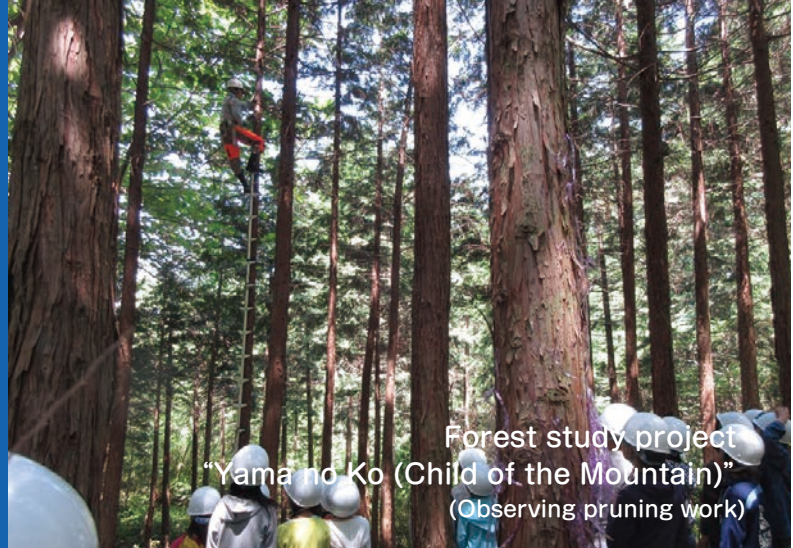
Forest study project “Yama no Ko (Child of the Mountain)” (Observing pruning work)