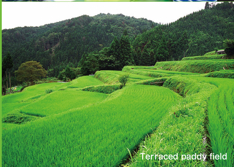
Terraced paddy field