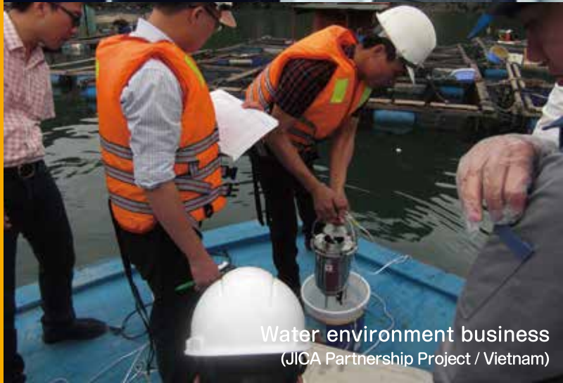
Water environment business (JICA Partnership Project / Vietnam)