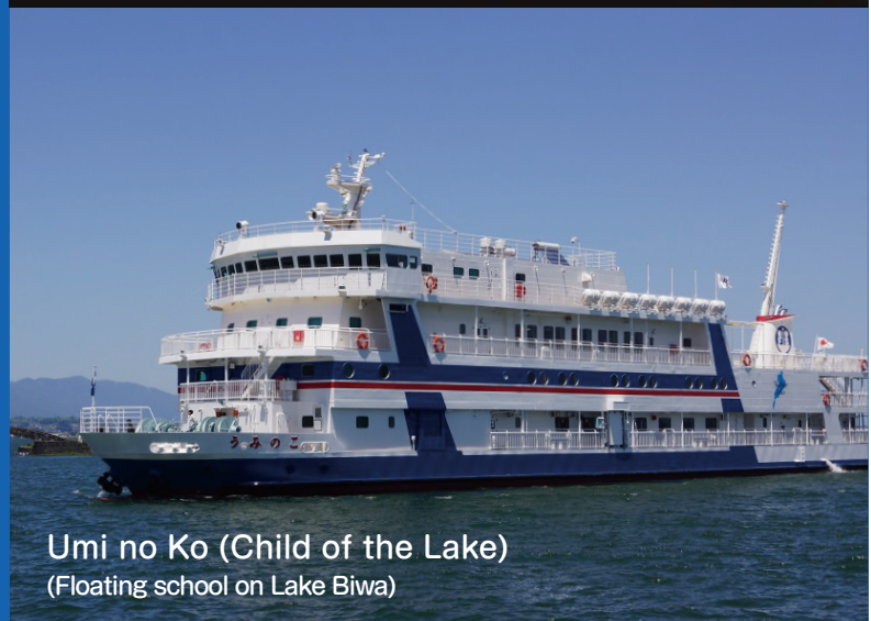
Umi no Ko (Child of the Lake) (Floating school on Lake Biwa)