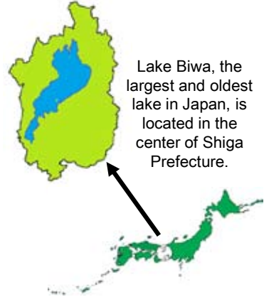
Lake Biwa, the largest and oldest lake in Japan, is located in the center of Shiga Prefecture.

Shiga Prefecture Population: 1,412,916 Land Area: 4,017.38km 2 As of October 1 2015(National Census)